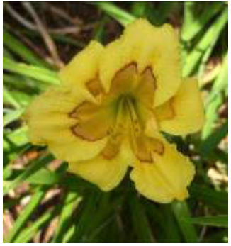
'Patchwork Puzzle' Small with a pattern eye