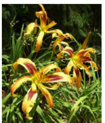
'Mystic Jellyfish' a spider