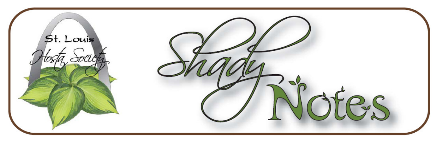
Volume 18, Issue 6