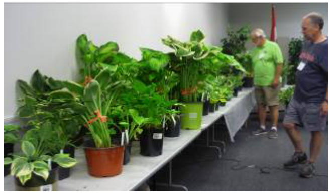
Members checking out the 2016 auction items.