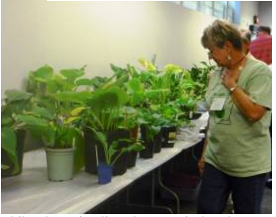
while others visualize where particular plants might fit into their landscape.