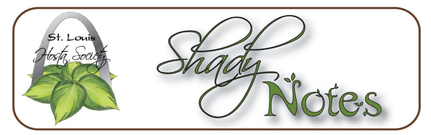
Volume 13, Issue 6