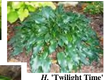
H. 'Twilight Time