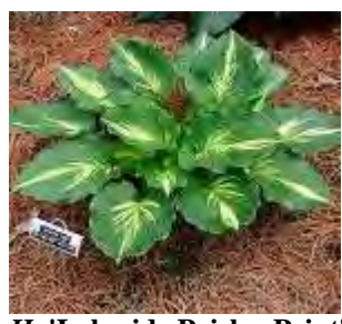
H. 'Lakeside Paisley Print'