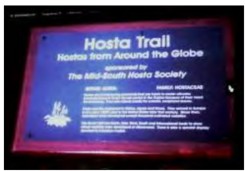
This plaque designates the Memphis 'Hosta Trail' as an AHS National Display Garden. The trail's purpose is to show where hostas originated and how they developed around the world.