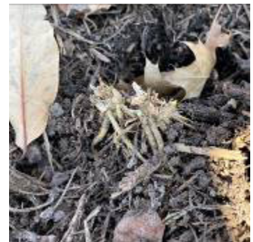
Frost heaved hosta

What fickle weather. Yesterday it was nearly 60, today it is in the 30s. So our winter has gone – days of near balmy temperatures, then plunges into the deep freeze. Feeling the itch to get outside, I strolled through my sleeping garden. Not much was going on. I did spy bright green leaves and the first white bloom of hellebore 'Double Queen'. Some strappy daffodil leaves were also pushing up. All great sights for winter-weary eyes.