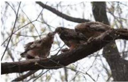
Caring for owlets